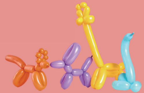
All-round Entertainer 全面表演者

Includes a magic show and bubble show, games, balloon twisting, leading the singing of the birthday song, and cake cutting.