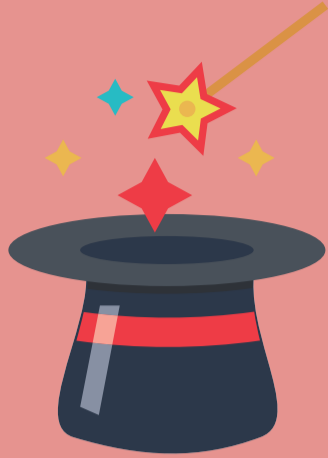
Magician or Clown 魔術師或小丑

Includes a magic show, games, balloon twisting, leading the singing of the birthday song, and cake cutting.