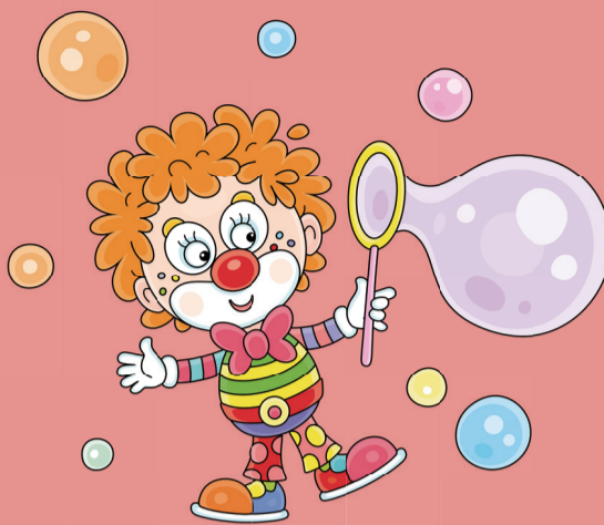
Bubble Show Entertainer 泡泡表演者

Includes a bubble show, games, balloon twisting, leading the singing of the birthday song, and cake cutting.